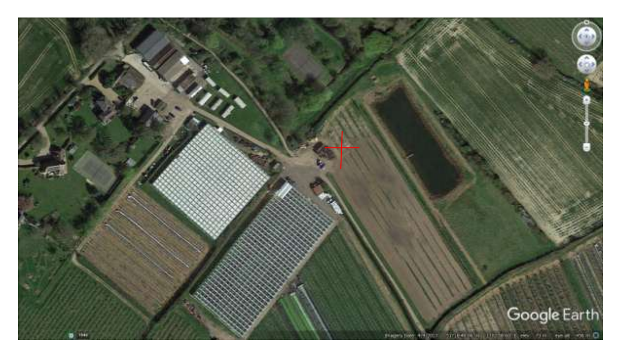
Plate 1. Aerial view of site (red target) showing the site prior to development.