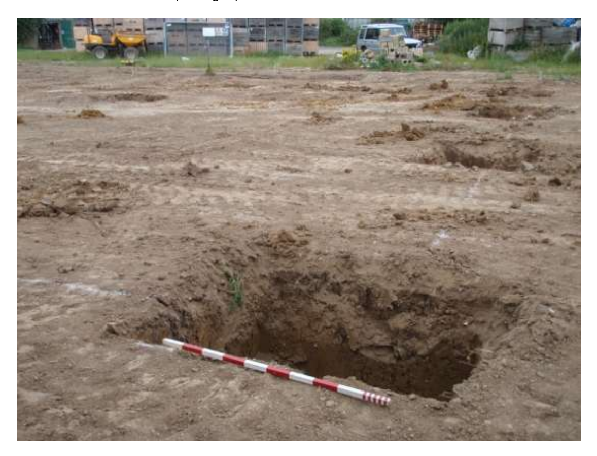
Plate 3. View of ground reduction and post pits(looking E)