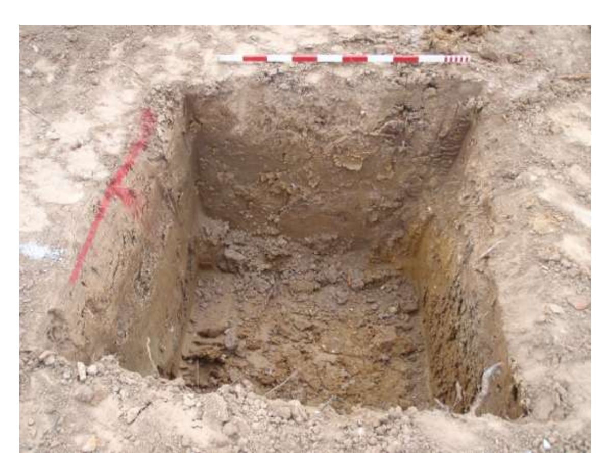
Plates 5, 6. View of the post pits