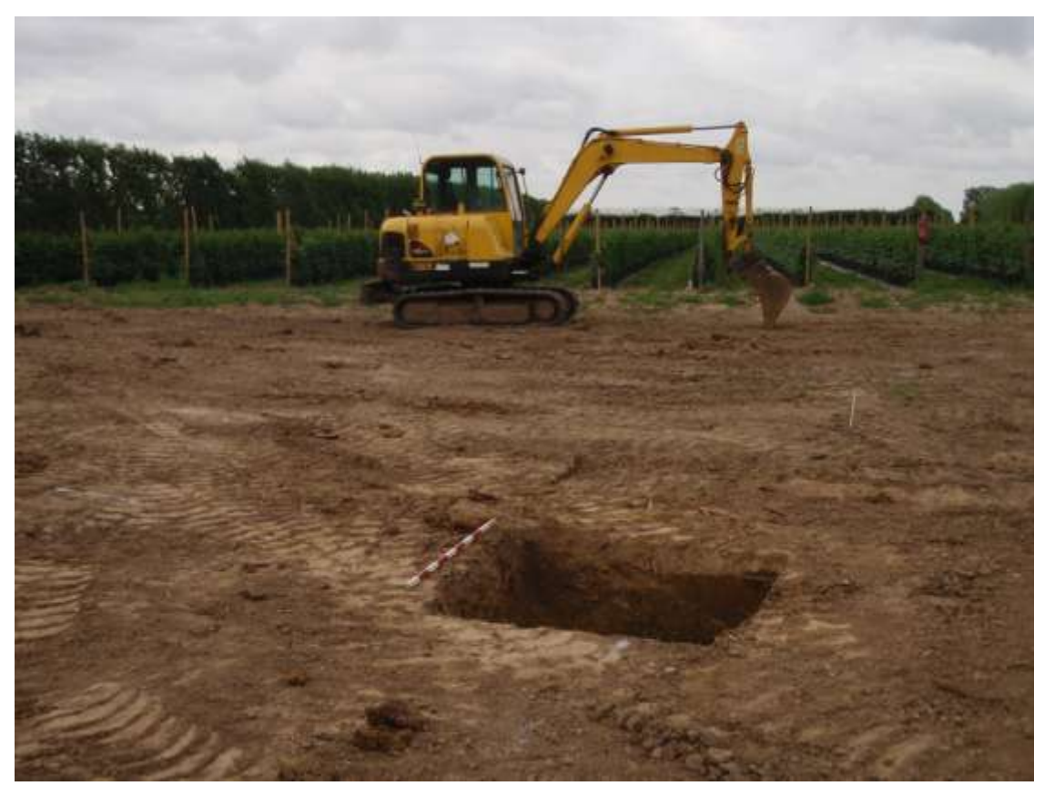
Plate 2. General view of site (looking SE)