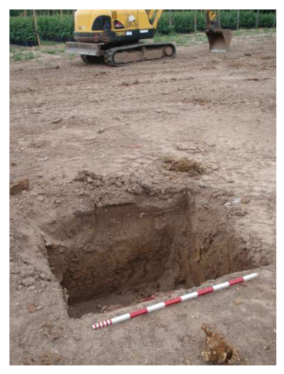
Plate 4. View of post pit (looking E)